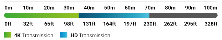
Cat6 Cable Performance Guide

WyreStorm recommends the use of shielded cable to minimize signal noise and interference