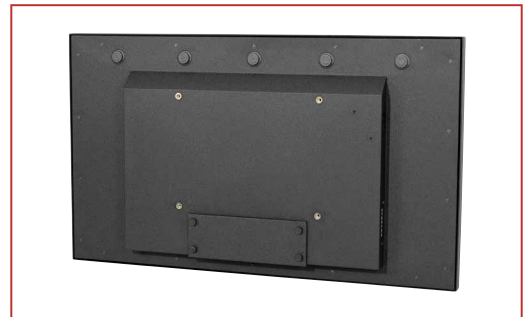
Sealed cable entry helps prevent water and debris from getting inside