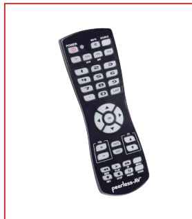
Waterproof Universal Remote

IPS PANEL Provides exceptional picture quality from any angle