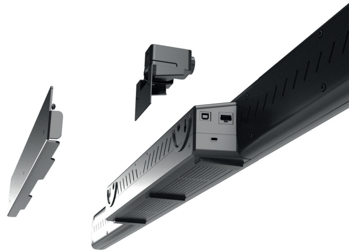
STEM WALL Mounting & Connectivity